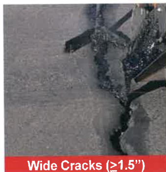
Wide Cracks ( \geq 1.5" )