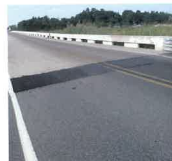
Bridge Deck Approach

Mastic One is a hot-applied, pourable, self-adhesive patching material used for preservation, maintenance and repair of asphalt and Portland cement concrete pavements and bridge deck surfaces. Mastic One is composed of highly modified polymer asphalt binder and durable lightweight construction aggregate. This product is formulated for distresses larger than those typically repaired by crack or joint sealing, but smaller than those requiring remove and replace patching procedures.